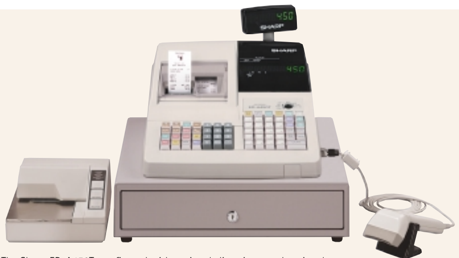
The Sharp ER-A450T, configured with optional slip printer and optional scanner, delivers superior functionality to your business.